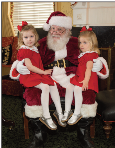
A Visit with Santa