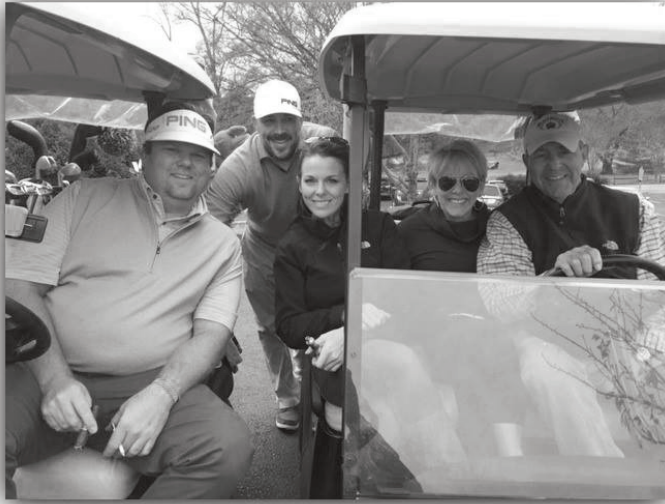
Great Day on the Golf Course!