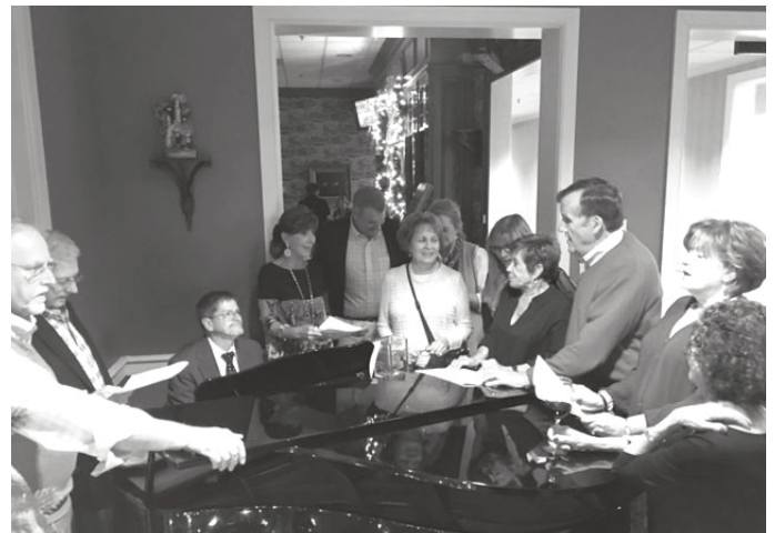
Singing Christmas Carols